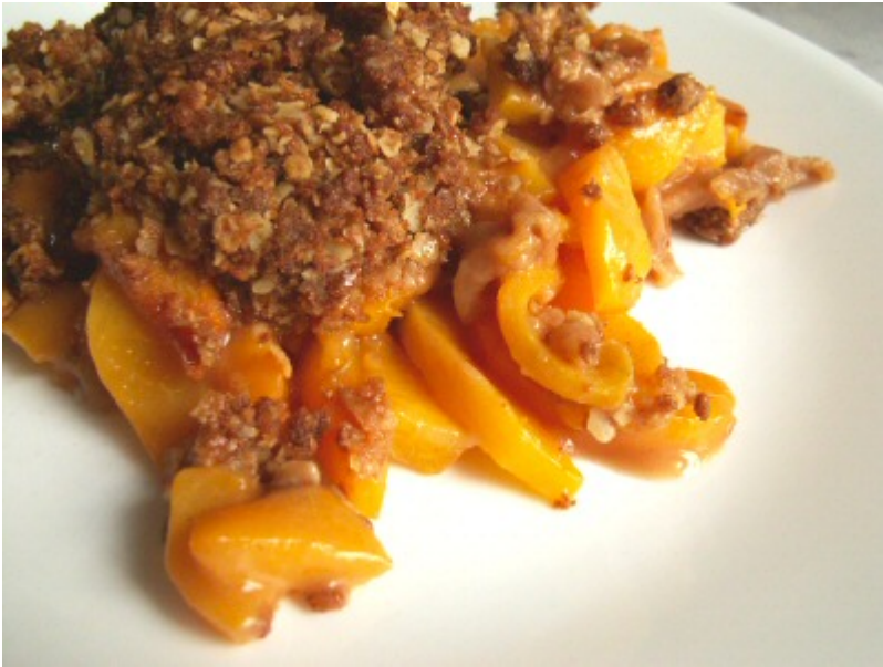
Fresh Peach Crisp