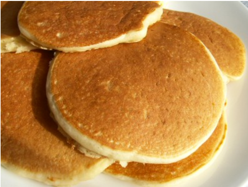
Fluffy Kefir Pancakes

5. Serve immediately, or keep pancakes warm on a plate in the oven until all have been cooked. Serve with butter, fresh fruit, or syrup. Enjoy!