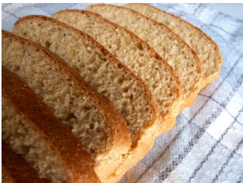
Homemade Wheat Bread

5. Remove bread from oven and allow to rest in pan for a few minutes. Remove to a wire rack and cover with a cloth. Slice and enjoy while still warm! Leftover bread can be stored in an airtight bag or frozen until needed.