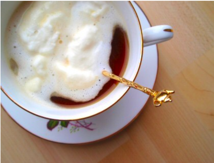
Chai Tea Latte (like Starbucks)

discard teabags. Stir in the sugar until dissolved. Add whipped cream and stir. Enjoy hot!