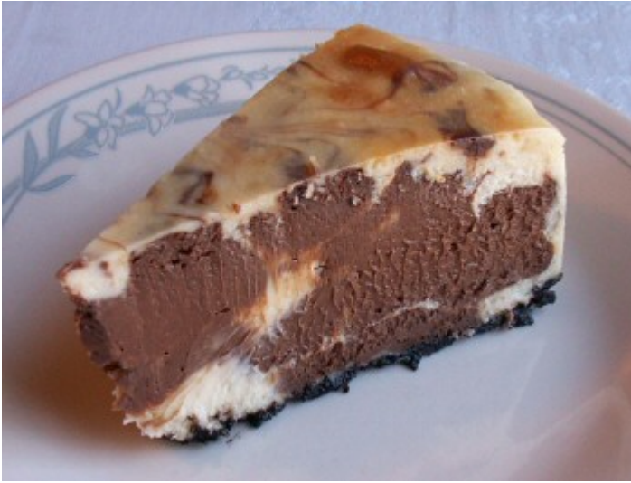
Chocolate Vanilla Swirl Cheesecake

uncovered, for 6 hours or overnight before serving. When cutting cheesecake, use a sharp knife and wash knife between cutting each slice.