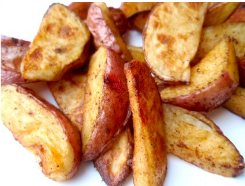
Seasoned Baked Potato Wedges