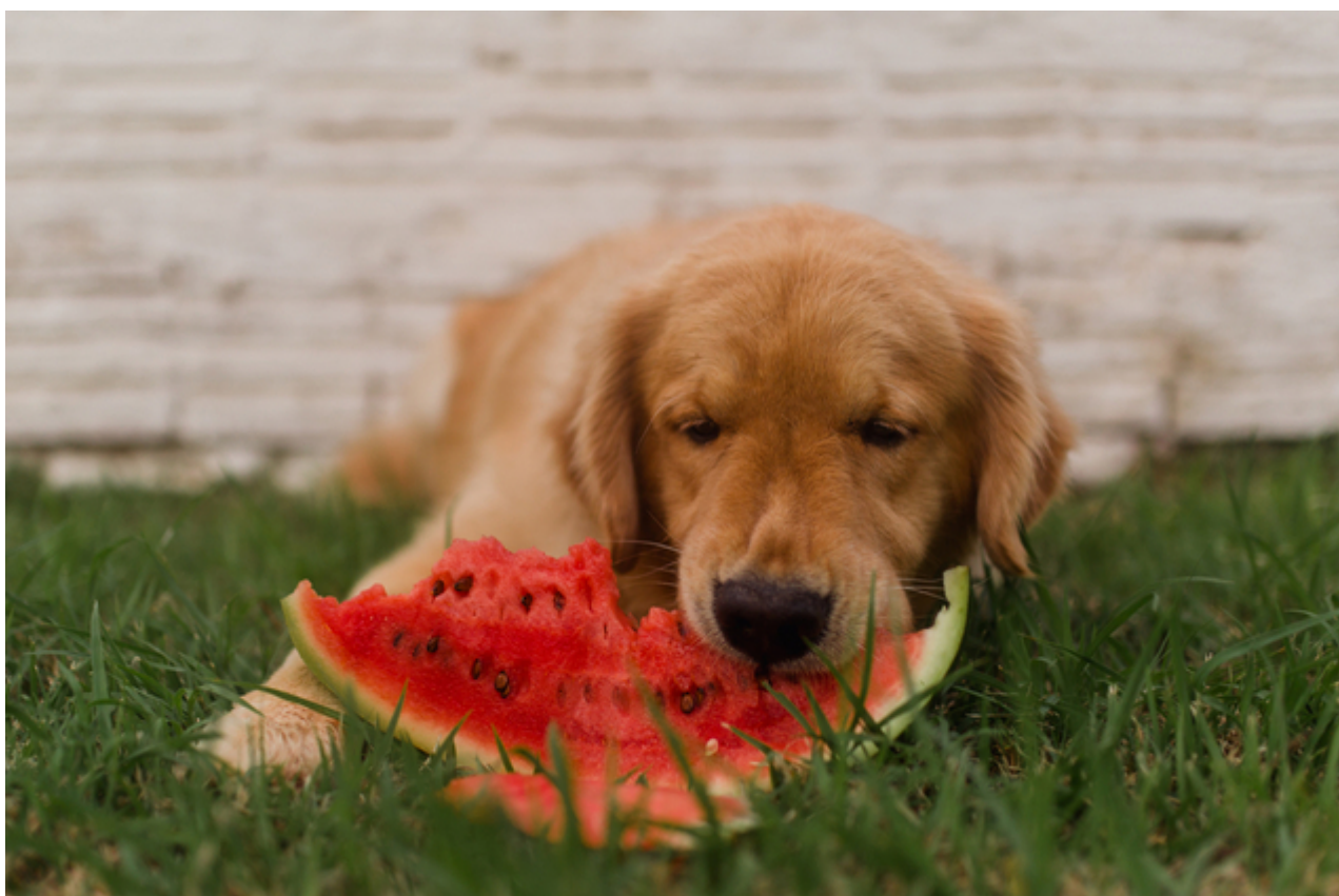
Dog eating watermellon

Some products are marketed as watermelon flavored, but are in fact made up of entirely artificial products. These artificial products may contain sugars, chemicals, and other substances that can make your dog sick. Artificial watermelon products frequently contain xylitol, which can be toxin to dogs. Never feed your dog any foods with large amounts of sugar as it may cause gastrointestinal problems, obesity and diabetes.